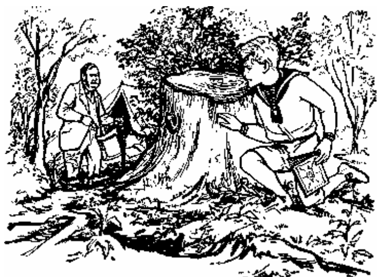
The man quite obviously thought he was alone

'Hi, what are you doing?' Then, as the man looked up, startled, Ste turned and running back into the shelter of the trees yelled: 'Uncle-Uncle, there's a man taking our things. Hurry!'