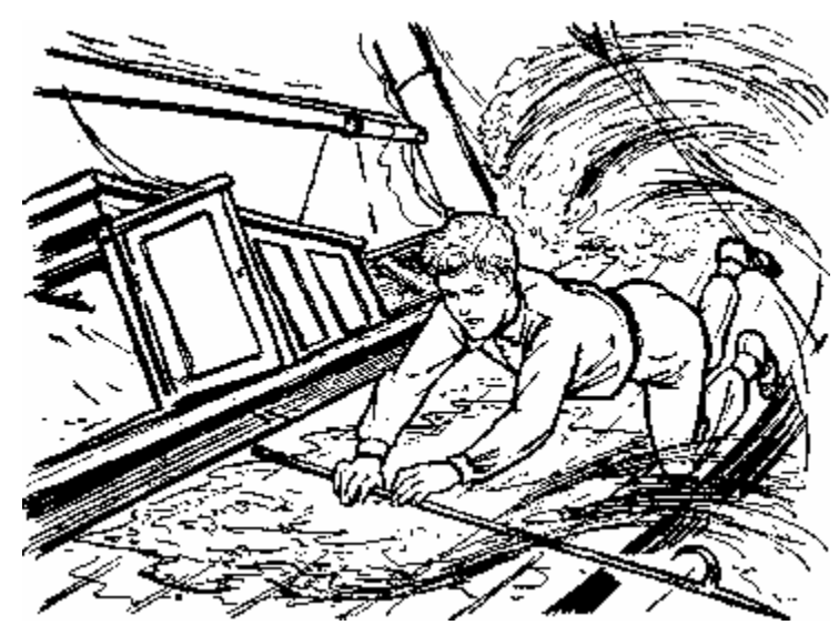
He flung himself down to grab the boathook