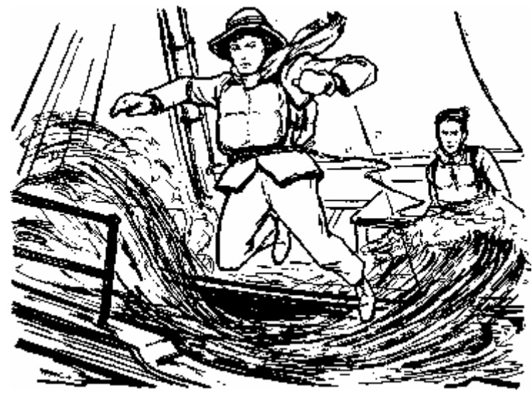
The leaf was a matter o/ split-second timing

'Splendid, young 'un, splendid,' made a youthful pair of shoulders go back squarely, and a chin lift in pride.