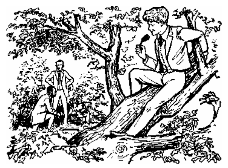
From his hide-out in the tree, B-P watched

From fifteen feet up B-P looked down on his little camp fire. Two men had found it. One had taken a risk by walking through the knee-high nettles, and was wishing he had gone the other way. The second master had gingerly brushed aside the clinging branches of blackberry as he made his way through to where the rabbit, looking very small and nicely brown now, hung in its separate parts over the glowing fire.