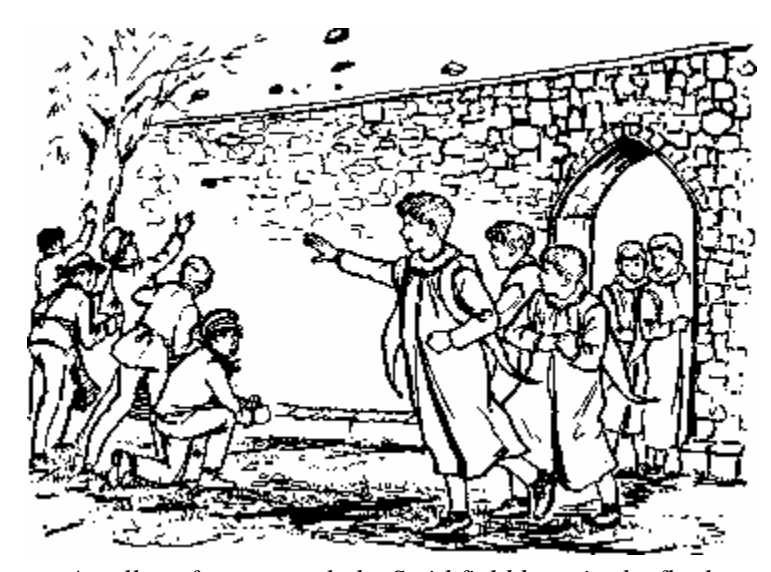
A volley of stones took the Smithfield boys in the flank

'For the benefit of the ill-informed,' B-P said, his eyes twinkling, 'it means "Those who are about to die salute those who are about to die. And that's us. You new chaps – mortis causa! You don't know that? Hrrmpy!'