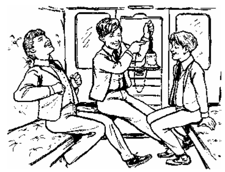
'We'll leave it on the company's land'

There was a waving of a green flag, a loud chuff-chuff, cheers from the thronged compartments, and the London train was on its way again. In their compartment, with the bell hidden behind B-P's case, the two boys wisely remained seated until the station had been left behind. B-P was not unmindful of the fact that he had red hair, a not very common colour among the Charterhouse crowd.