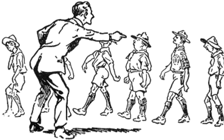
A boy learning what he can as a Scout has a good chance in the world

Remember that "a difficulty is no longer a difficulty when once you laugh at it—and tackle it".