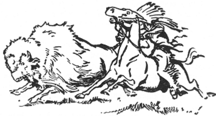
The Red Indians had to be courageous to survive. They depended on buffalo meat for food, and buffalo hunting was dangerous.

There are lots of men who go about howling about their rights who have never done anything to earn any rights. Do your duty first, and you will get your rights afterwards.