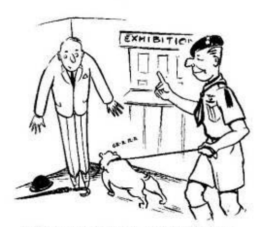
"Hit on something to arrest the attention."

When photographs are used in a thematic window display do not overcrowd the available space with a lot of small prints. Keep to a few and make them large. Nothing smaller than 15" x 20". Except where an amplifying description is essential, the photographs should speak for themselves. Captions should be short and understandable in a single reading. Each should carry the story on in a logical progression.