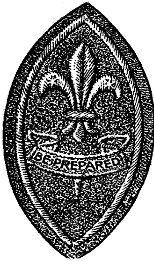
FIRST CLASS ROVER BADGE

Before being awarded the First Class Rover Scout Badge a Rover Scout must pass the following tests to the satisfaction of a qualified examiner: –