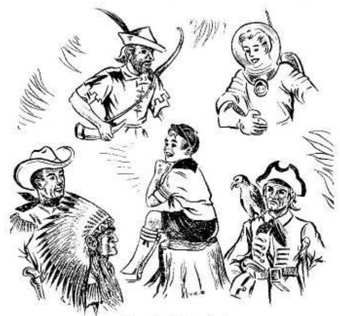
'But why the Jungle '

murderers is hardly the ideal for Scouting! "Cowboys and Indians": an outdoor atmosphere but too much fighting and too little moral code. "Spacemen": you can (if the influence of comic strips of war with Mars and Venus is not too strong) put any interpretation on these but they must fail in the end because they are exclusively man-made. There is no room for wonder, for love of nature, for apprehension of an ideal.