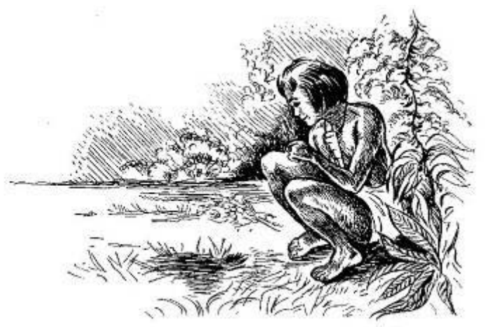
The maxims of Baboo-'Let him think and be still'