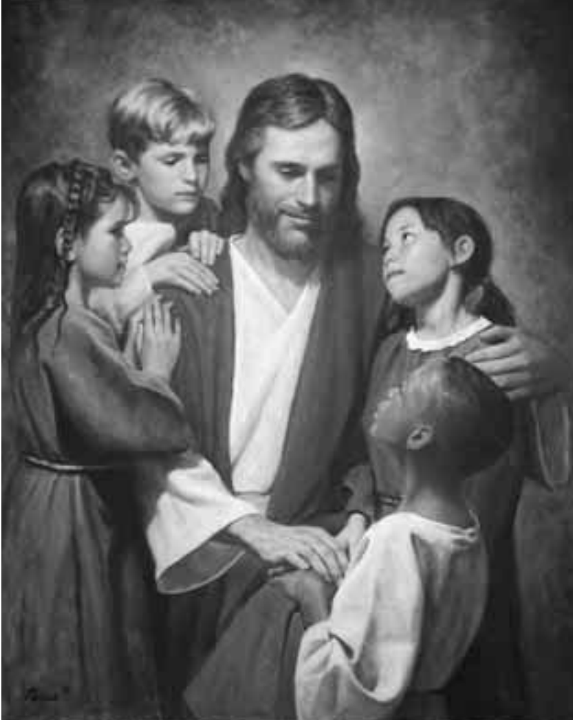
Jesus Christ with children from around the world.

We are all spirit sons and daughters of Heavenly Father. If we accept the full blessings of the Savior's Atonement, we can return to live with our Father and our Savior again.