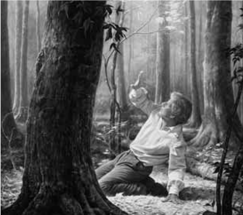
With the First Vision, the dispensation of the fulness of times was ushered in by “a revelation of the personality of God the Father and the Son” to the Lord’s chosen prophet.

and his Son, our Savior, when, as glorified personal beings who could talk with and be seen of men, they conversed with him, as though to demonstrate their tangible reality, as the dispensation of the fulness of times was ushered in, in preparation for the second coming of the Lord to reign as Lord of lords and King of kings at the commencement of the millennium. 13