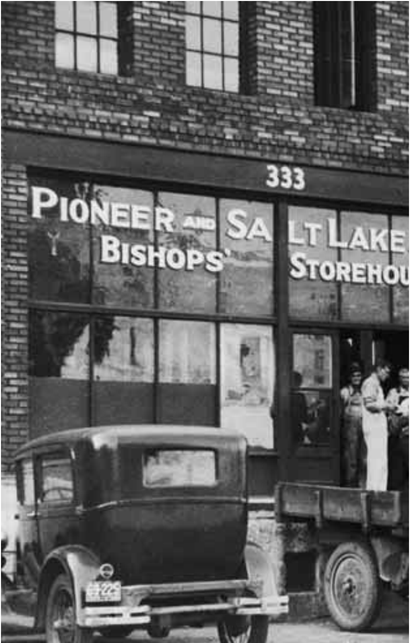
The bishops' storehouse for the Pioneer and Salt Lake Stakes, Salt Lake City, Utah, 1933. Harold B. Lee was president of the Pioneer Stake at that time.