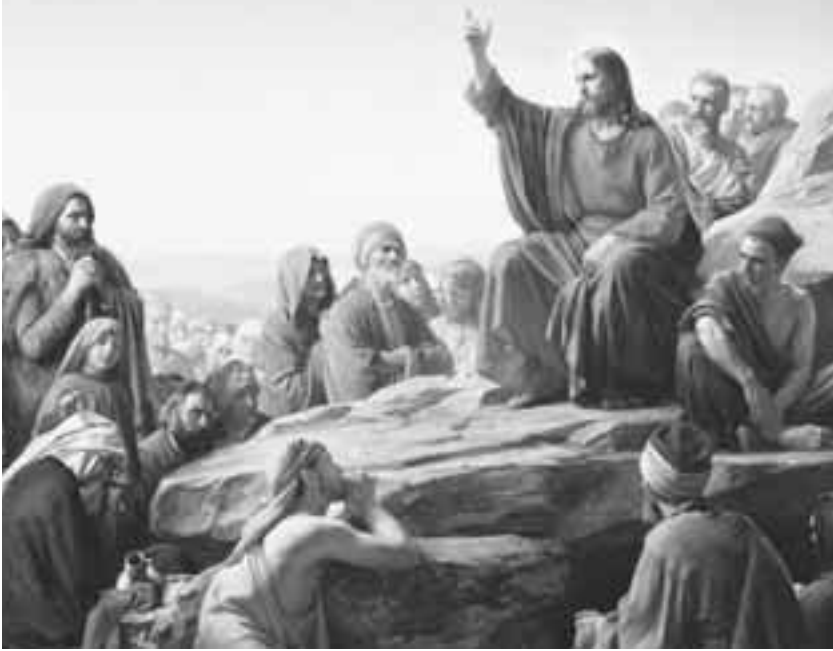
In the Sermon on the Mount, the Savior gave us the “constitution for a perfect life.”