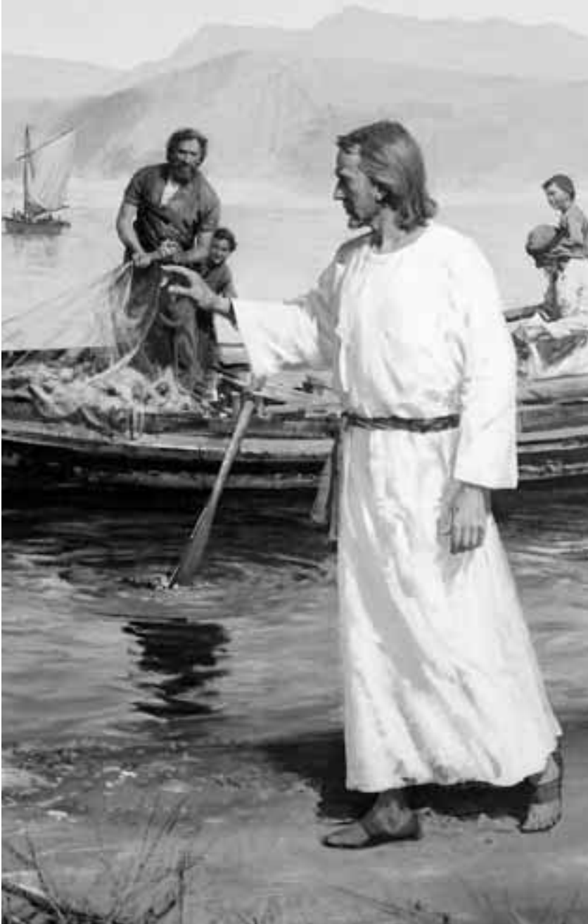
Jesus Christ calling Peter and Andrew.

The Atonement of the Savior was necessary to make possible the Father's plan of salvation. By following the Savior, each person can safely complete his "journey through mortality to his ultimate destiny—a return to that God who gave him life."