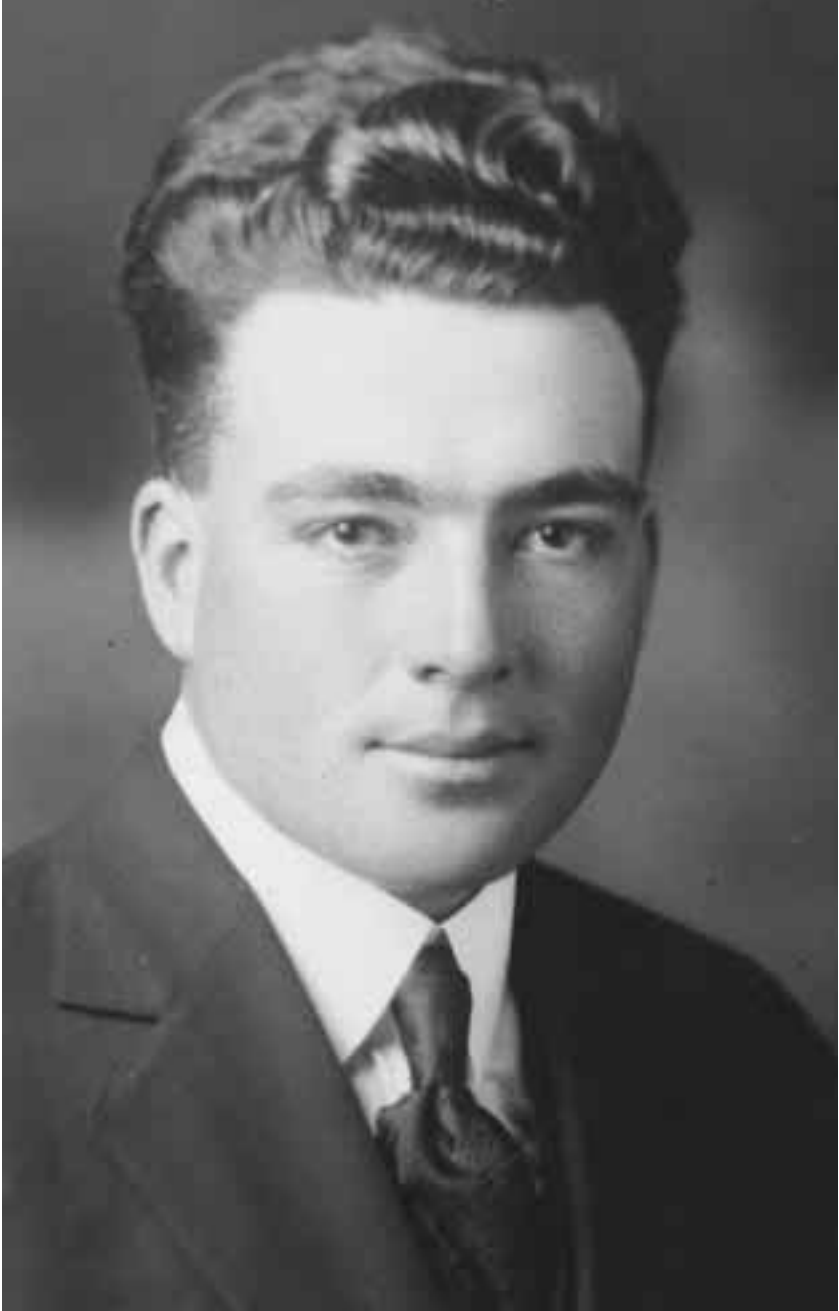
Elder Harold B. Lee as a missionary in the Western States Mission. He served from November 1920 to December 1922.