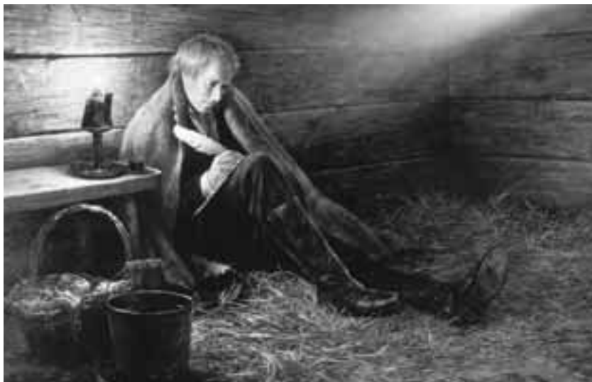
While the Prophet Joseph Smith was facing great adversity in Liberty Jail, he received the comforting revelations that became sections 121 and 122 of the Doctrine and Covenants.

“The Son of Man hath descended below them all. Art thou greater than he?