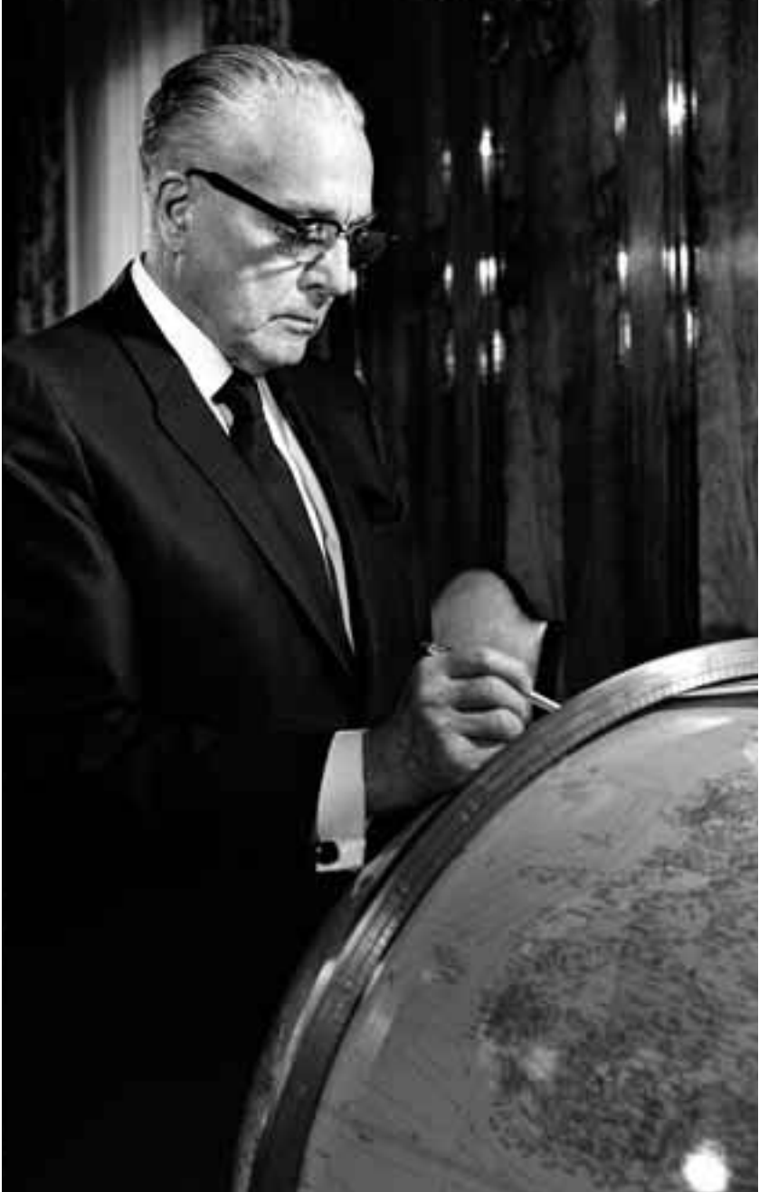
President Harold B. Lee