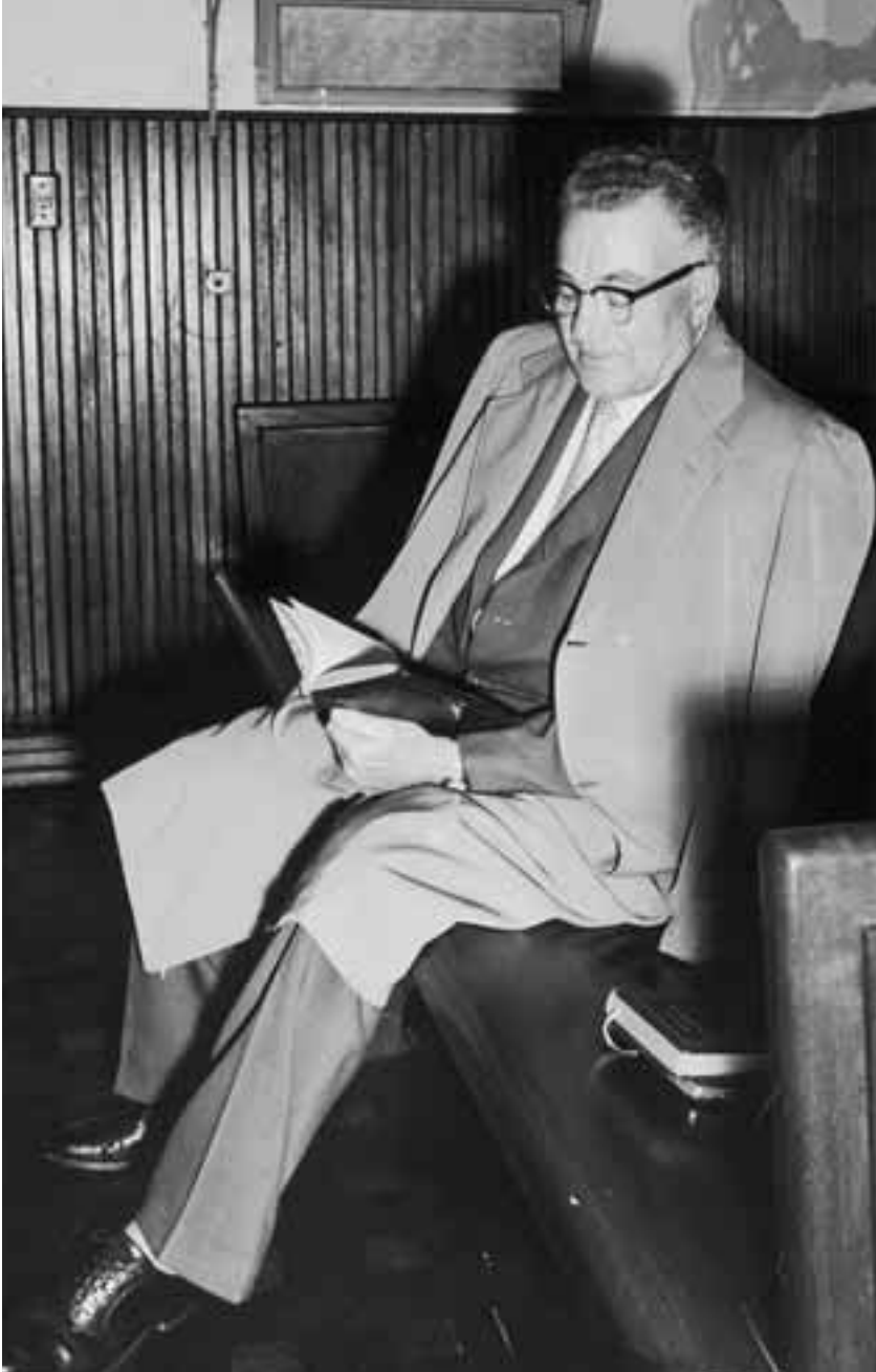
President Harold B. Lee loved the scriptures and used them to teach the Saints. He said, “If we’re not reading the scriptures daily, our testimonies are growing thinner, our spirituality isn’t increasing in depth.”