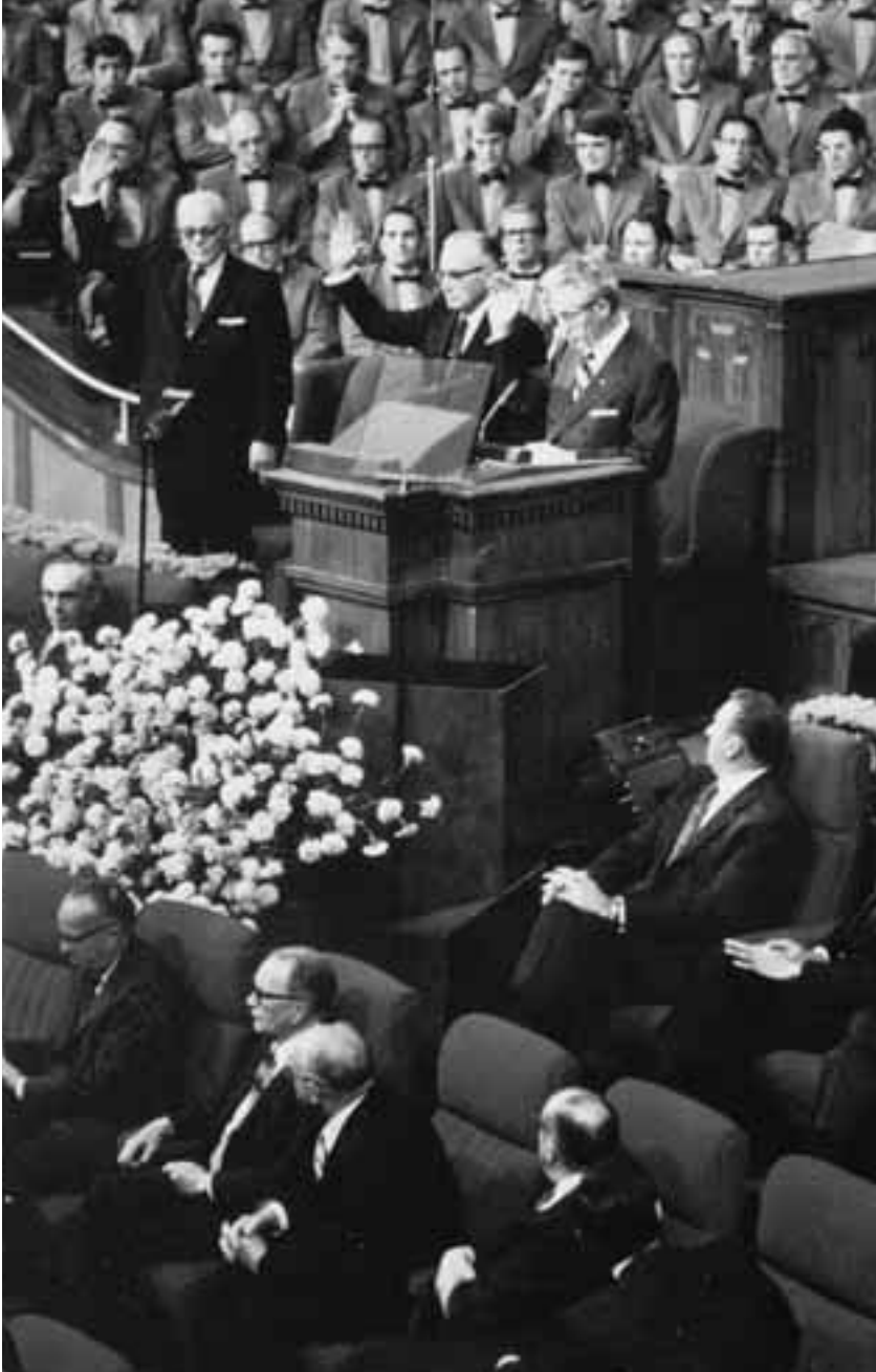
This photograph shows the First Presidency sustaining President Harold B. Lee as the President of the Church at a solemn assembly on 6 October 1972. President N. Eldon Tanner is at the podium, and President Marion G. Romney is to President Lee's right.