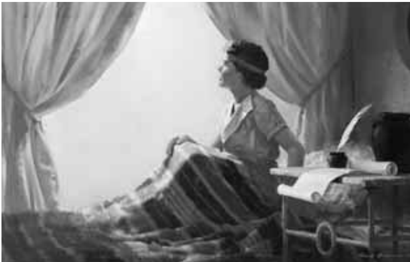
Like the boy Samuel, we should be willing to say, “Speak, Lord; for thy servant heareth” (1 Samuel 3:9) and then act courageously on the answer to our prayer.

Fast two meals on the first Sunday of the month and pay the full value of those two meals from which you have abstained. . . . The Lord said to Isaiah, that those who would thus fast and deal out their bread to the hungry, could call and the Lord would answer, could cry and the Lord would say, “Here I am.” [See Isaiah