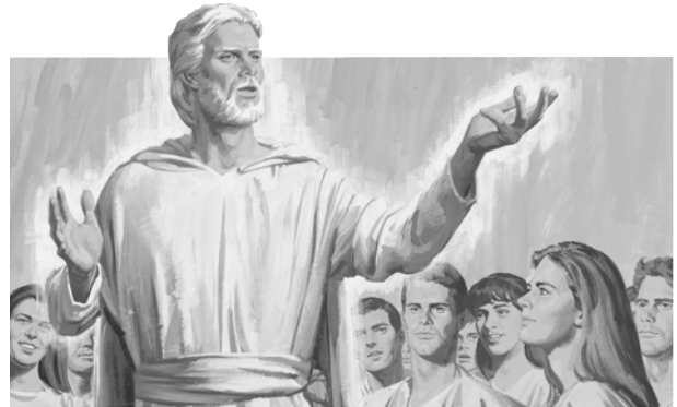
Heavenly Father explains the plan of salvation.

“Mortality is very brief but immeasurably important.”